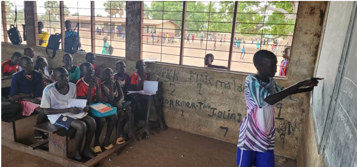
Students during class at Pagarau Primary School

Pagarau Primary School is located at the centre of Pagarau Payam, Yirol East County, Lakes State. It is supported by Plan International, an implementing partner organisation in the ECW MYRP program for South Sudan. For years, limited resources like teaching and learning materials, low teacher morale due to poor remuneration and delayed salaries led to decline in school performance. Student enrolment had decreased by about 40% at the start of 2023.